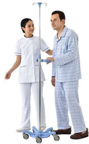
IZ-C508 IV Stand